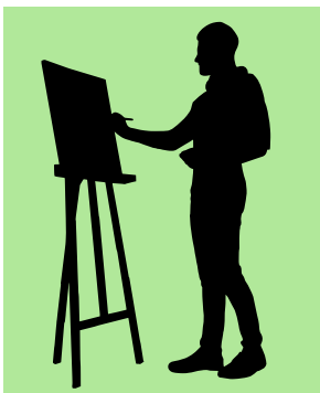
BOOK BY BLACK ILLUSTRATOR