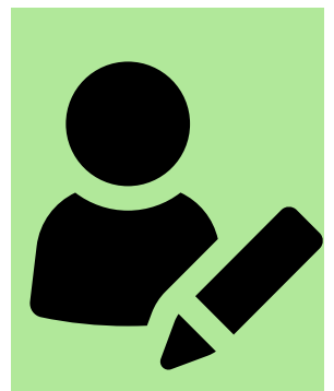
BOOK BY A BLACK AUTHOR